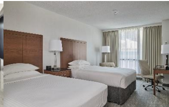
Chelsea double guestroom